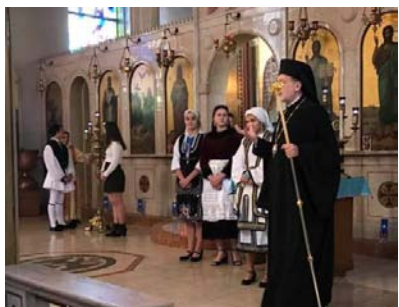
1st Annual Hellenic Folk Dance Festival Greek Orthodox Metropolis of Detroit 2019