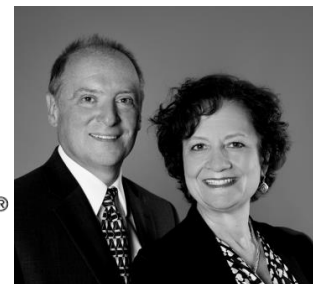
The Capranica Team TWO is ALWAYS better than one

2460 N. Reynolds Road Toledo, Ohio 43615 www.howardhanna.com