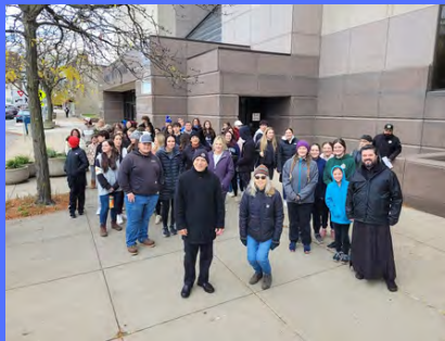
Parents of Young Children