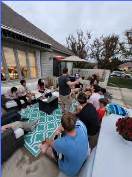
Hope and Joy