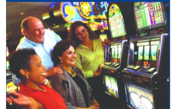
Visit to a local Casino