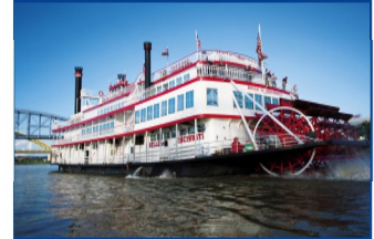
Enjoy a BB Riverboats Sightseeing Cruise

Departure: Holy Trinity Greek Orthodox Cathedral, 740 Superior St, Toledo, OH @ 8 am