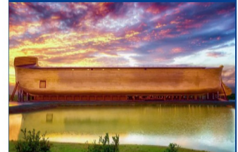
Enjoy a Visit to the Famous Ark Encounter