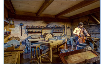
View from Inside the Ark Encounter